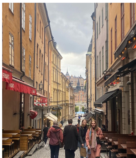
Street in Stockholm from Savannah

Curious about these different perspectives, I decided to look at the statistical differences between Sweden and the United States. According to the OCED Better Life Index, six per 100,000 people are murdered while walking at night in the U.S., while the rate in Sweden is 1.1 per 100,000 people. Sweden is lower than the average 2.6 per 100,000 reported by the OCED Better Life Index. My Swedish friends told me that these fears are not common in Sweden. They feel relatively safe while walking home at night; they are aware of their surroundings but