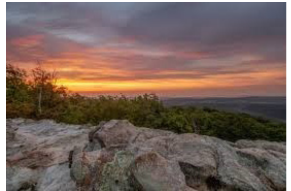
Bee Rock Overlook in Cookeville, Tennessee