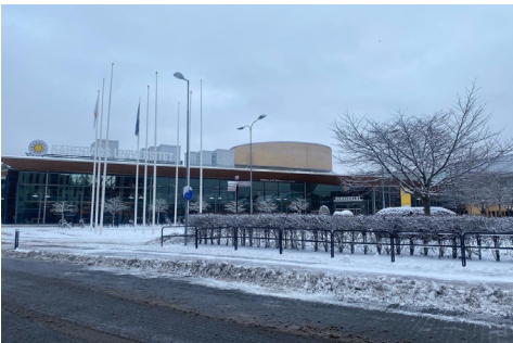
Karlstad University, Sweden

From the U.S. Grand Canyon to the Swedish Stockholm Cathedral and all the way to South Korea's Changdeokgung Palace, Earth is a vast, diverse home to many different communities. Not one place is the same. Because of this, traveling is a passion many people around the world share. It is human nature to have a desire to see and learn about others and their cultures. In the United States, we are lucky to know and experience diversity, but we are isolated and ignorant of many other cultures. The study abroad program at Tennessee Tech aids students in their desire to see the world. I interviewed two students, one who studied abroad in the Fall 2022 semester in Europe, and one from abroad who is studying in Cookeville during the Spring 2023 semester.