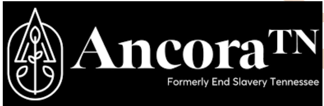
Ancora TN's Logo

Tennessee leads the nation in working to combat human trafficking. Ancora, a nonprofit organization based in Nashville, is a member of the Tennessee Counter-Trafficking Alliance (TCTA) and manages referrals for the 41 counties in Middle Tennessee. The organization began serving Middle Tennessee over 12 years ago as End Slavery Tennessee and